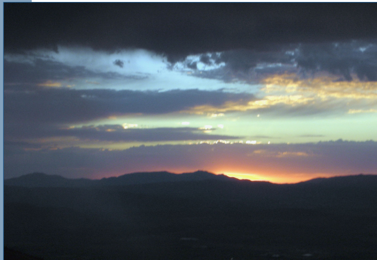
photo: Lake Tahoe at sunset